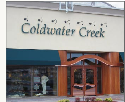
■ A few of our recent installations